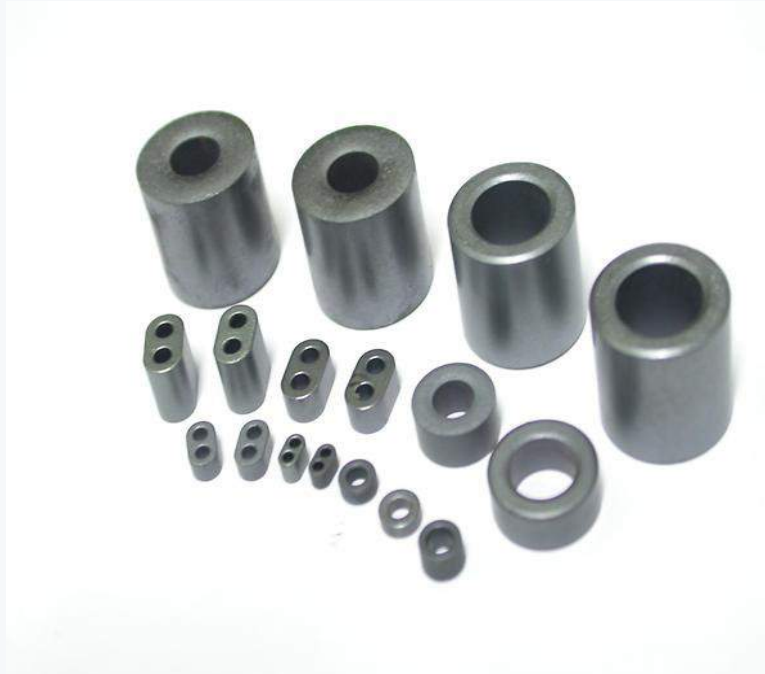
Just a few of the shapes that soft ferrites can be molded into.

Damage to a balun's wire windings or capacitors usually are obvious to a visual inspection, but a balun's ferrite core, be it a torus, a bar, or something known as a pig-nosed ferrite core - its damage can be a very subtle thing.